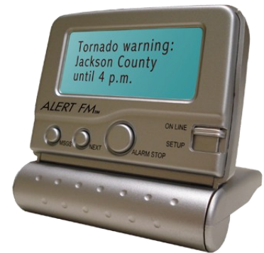
ALERT FM Receiver