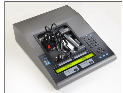
Cadex C7200 Battery Analyzer