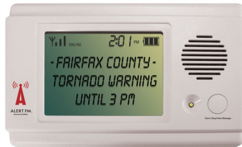
ALERT FM Wall Receiver