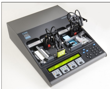
Cadex C7400 Battery Analyzer

Battery University™ is sponsored by Cadex Electronics Inc. , a manufacturer of advanced battery analyzers, chargers and monitoring devices. The information is free of charge for the benefit of battery users. www.batteryuniversity.com